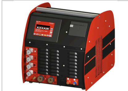
Driven by AXXAIR power source ( cf compatibility table )