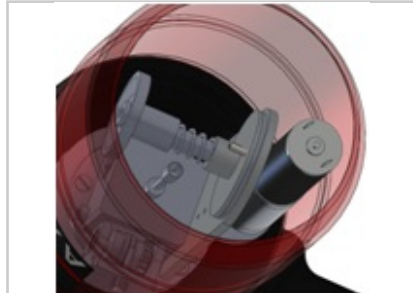
Wire supply rotates along with head